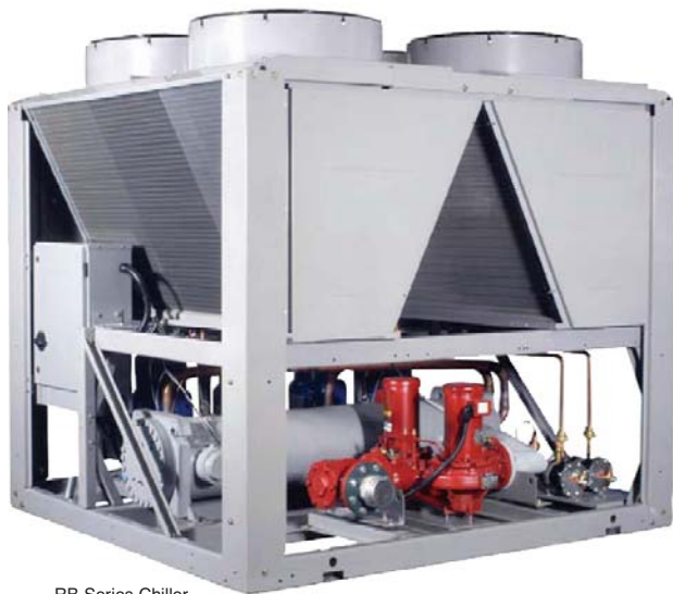
RB Series Chiller.

The 30RB Series chiller is an effective all-in-one package that is easy to install and use.