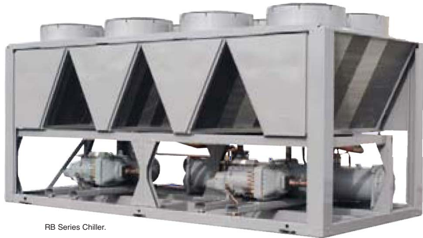
RB Series Chiller.