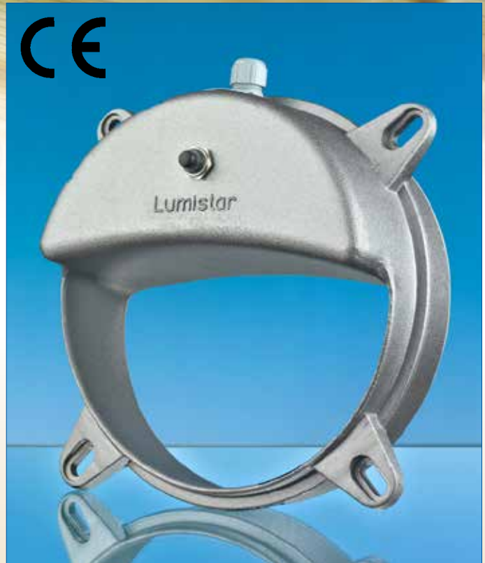
Lumistar luminaire, for installation on sightglass fittings