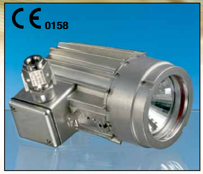
Stainless steel Lumiglas luminaire, type ESL 26-Ex

Simple electrical connection via integrated terminal box. Simple lamp replacement thanks to optimal threaded ring design.