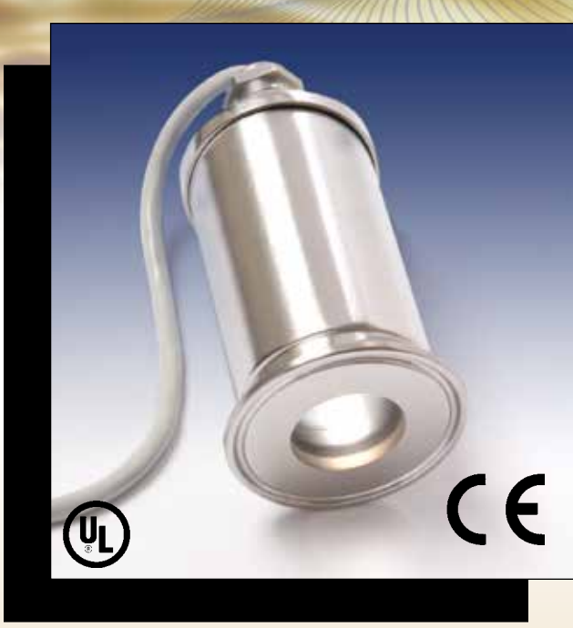
MetaClamp® with Lumiglas® Light