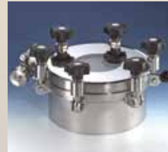
Type 99.ZIM: Pressure Manway with Integrated Metaglas