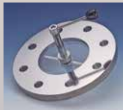
Type 13.SW: Sight Glass Flange - with Wiper