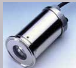
Type 80.USL33: MetaClamp® Sanitary Clamp Fitting with USL-33 Luminaire