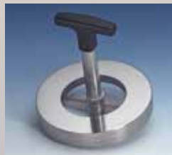
Type 73.SW: Sight Glass Discs with Wiper