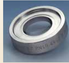
Type 74: Sight Glass Discs with Tongue and Groove Joint