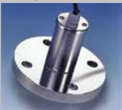
Type 19.BIO.USL33: Bolt On Sight Glass for Sterile Applications using Sight Glass Luminaires or USL-33