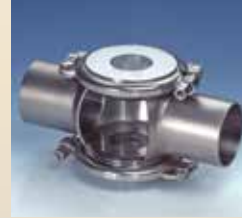
Type 99.TUC: Sight Glass with Luminaire for Varivent-In-Line Fittings