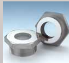
Type 61: Threaded Sight Glasses - Hexagon head, NPT or other threads