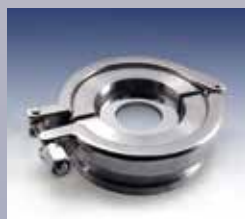
Type 80.TCI.CC: Sight Glasses for Clamp Style Flush Mount