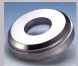
Type 83: Sight Glass Discs for Aseptic Screwed Pipe Connection DIN 11864