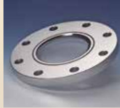
Type 19.BIO: Bolt On Sight Glass for Sterile Applications O-Ring Seal