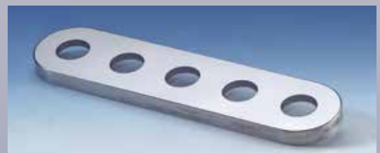
Type 99.LSG: Fused Metal Elongated Sight Glass for Rectangular & Obround Sight Windows and Armored Liquid Level Gages