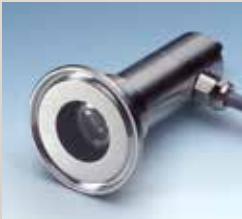
Type 80.USL01: MetaClamp® Sanitary Clamp Fitting with USL-01 Luminaire