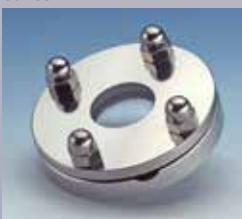
Type 99.NA: Sight Glasses for Flush Mount Hygienic Weld Pad