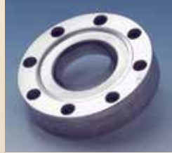
Type 19.CF: Sight Glass Discs for ConFlat high vacuum applications