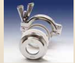
Type 80: MetaClamp® Sanitary Clamp Fitting