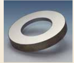
Type 76: Sight Glass Discs for ANSI Flange connection