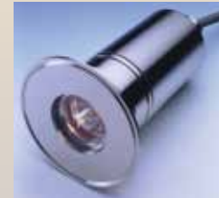
Type 80.ESL25: Sight Glasses for Use with Clamp Connections and Sight Glass Luminaire ESL-25 EX