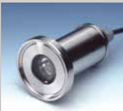
Type 83.USL33: Sight Glass Discs for Aseptic Screwed Pipe Connection DIN 11864-1 for Mounting Luminaires USL-33