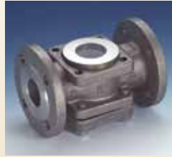
Type 77: Sight Glass Discs for Visual Flow Indicator Fittings