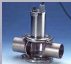
Type 99.TUC.USL33: Sight Glass with USL-33 Luminaire for Varivent-In-Line Fittings