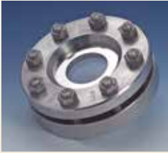
Type 73: Sight Glass Discs for DIN 28120 and other weld type assemblies