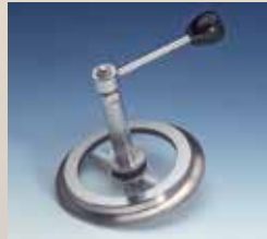
Type 80.SW: MetaClamp® - with Wiper