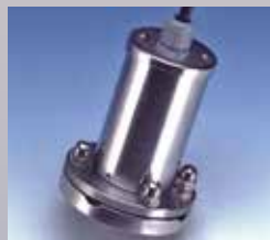
Type 99.NA.USL33: Sight Glasses for NA-Connect Fitting with USL-33