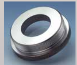
Type 64: Threaded Sight Glasses - Round head