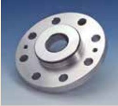
Type 903: Sight Glass Discs for Sterile Applications, stepped for flush mount