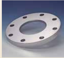
Type 13: Sight Glass for ANSI Flange Connection type full face