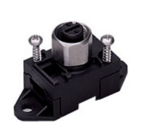
AS-i insulation displacement connector

The C-TOP units can be set up according to the customer's requirements.