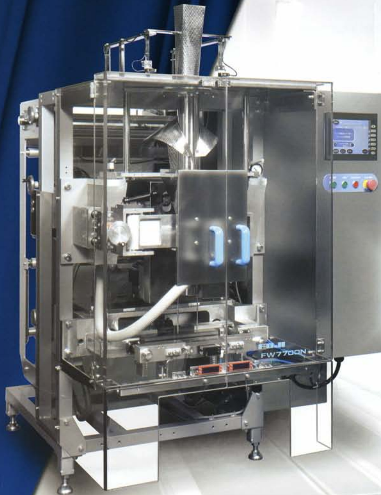
FW7700N WITH OPTIONAL DEVICES.