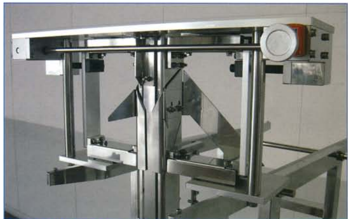
Adjustable bag former (Option)