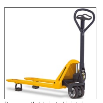
Permanently lubricated joints for maintenance-free operation