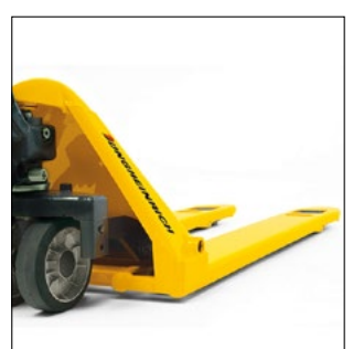
Low profile, sturdy forks