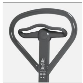
Ergonomic operating handle