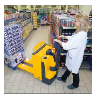
In operation in a store