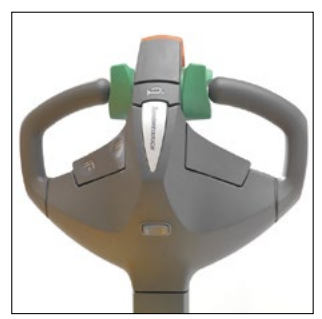
All travel and lift functions are in the ergonomic multi-functional tiller head