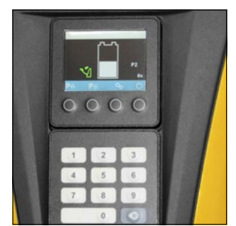
New 2" enlarged truck display