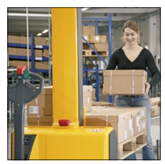
Use as lifting table for loading with