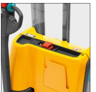
Good storage options for pens, tools and documents

• Precise and gentle lifting of the load by speed-controlled hydraulic motors.