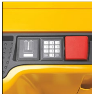
CanDis and CanCode display instruments