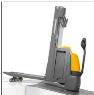
Negotiating a ramp with the EJC 212z/214z/216z/220z