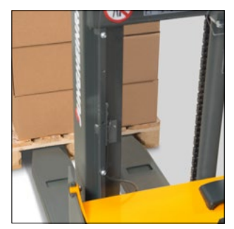
Optimum view of the forks and surrounding areas