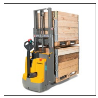
Double-deck operation - loading of two pallets one over the other