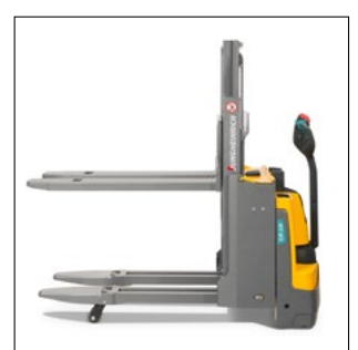
Compact due to extremely short front end dimension