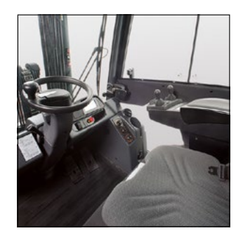
Workstation is comfortable and helps to maximise productivity