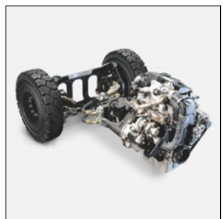
VW engines with low energy consumption