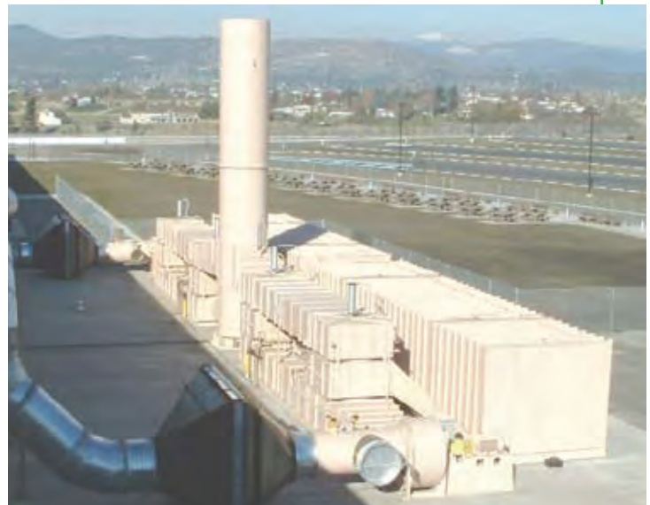
WOOD CABINET SPRAY COATING

RETOX RTO MODULES FROM 1,000 TO 80,000 CFM