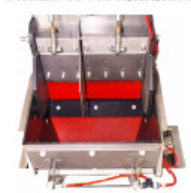
Patented Dual Chamber Accumulator