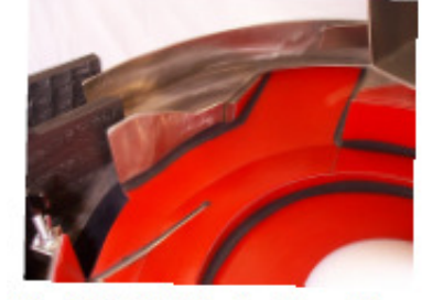
Dual Outlet Feeder Bowl for Singulated Batch Top Off